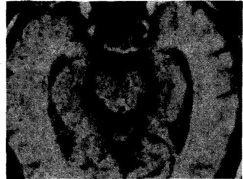
Figure 1. T1-weighted SE scan (TR 600, TE 40) in a patient with Alzheimer's disease shows large perimesencephalic cisterns and temporal horns, indicating medial temporal lobe atrophy.

A subjective appearance of prominent or enlarged sulci and ventricles was seen in all but one of the DAT patients. Similar findings were seen on four of the seven control patients. The general appearance of cerebral atrophy did not separate DAT from the nondemented patients. Furthermore, the ratio of brain area to brain plus CSF area at the level of the lateral ventricles was identical in the two groups (the ratio was 0.850).